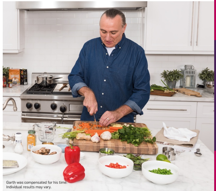
Garth was compensated for his time. Individual results may vary.

The most common side effects of COSENTYX include: cold symptoms, diarrhea, and upper respiratory infections.